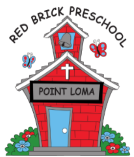
& TODDLER LEARNING CENTER

The Preschool is grateful for your support!