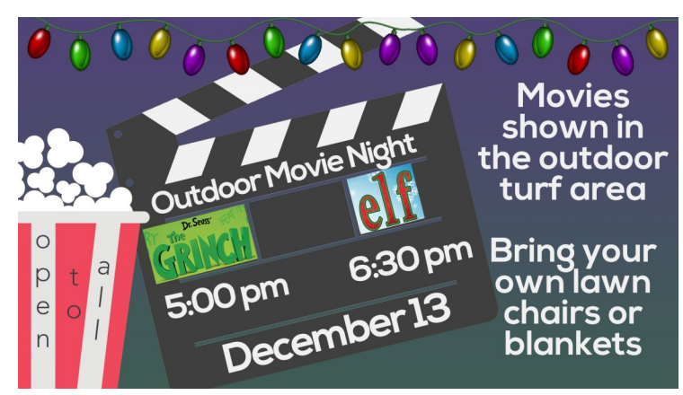
Save the Date—December 13

Family Movie Night under the stars in the turf area next to the Sanctuary. Bring your own chairs/blankets, and snacks as we enjoy a double feature—The Grinch at 5 pm, followed by Elf at 6:30 pm. Come for one or both of these great Christmas movies!